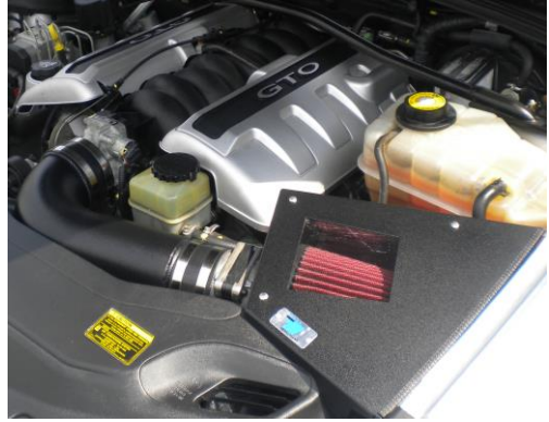
2004 Finished Install Example