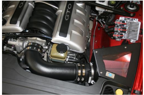
2005-06 Finished Install Example